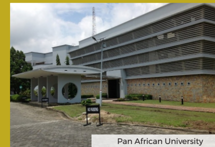
Pan African University