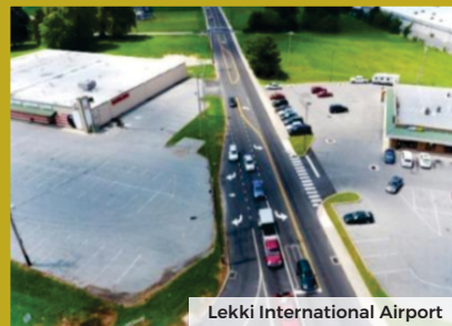
Lekki International Airport

With these, you are located at one of the most rapidly developing business hubs in West Africa.