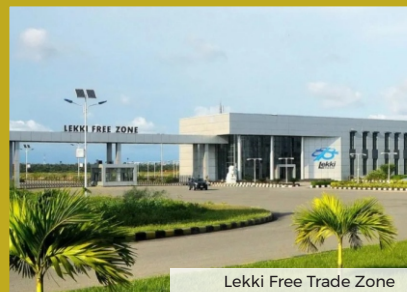
Lekki Free Trade Zone