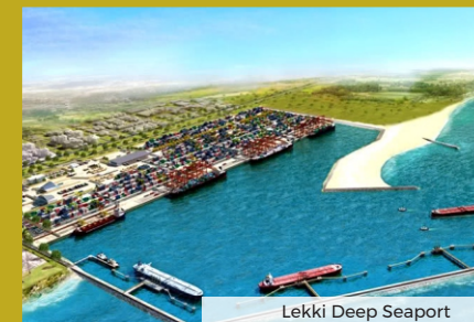
Lekki Deep Seaport